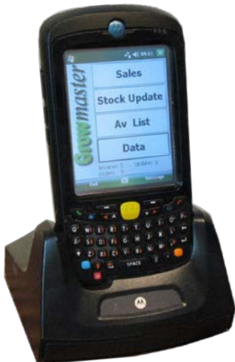
Handheld unit for quick and easy stock updates and 'cash sale' order entry

Receive orders and send invoices electronically using our EDI module. Vital for trading with many large organisations, such as B&Q or Homebase. Fully integrates with Growmaster sales order processing.