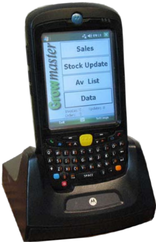
Handheld unit for quick and easy stock updates and 'cash sale' order entry

Receive orders and send invoices electronically using our EDI module. Vital for trading with many large organisations, such as B&Q or Homebase. Fully integrates with Growmaster sales order processing.